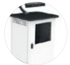
Half Open (HO) (8U Std)