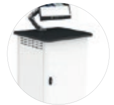
Solid Door (SD)