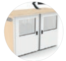
Half Glazed (HG) (8U Std)