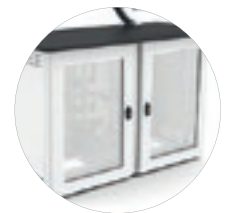
Full Glazed (FG)