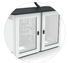
Full Glazed (FG)