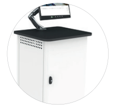
Solid Door (SD)