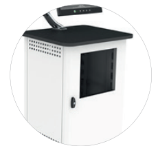
Half Open (HO) (8U Std)