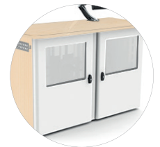
Half Glazed (HG) (8U Std)