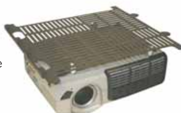
Removable Mounting Plate