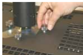
Micro Adjustment Screws