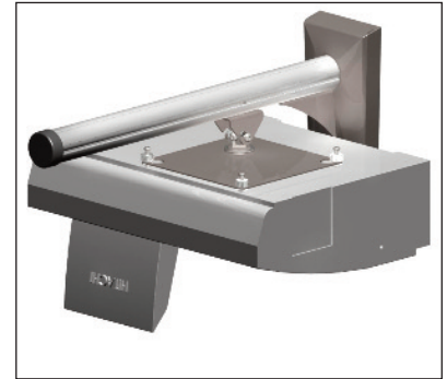
Closed position projecting 50" image