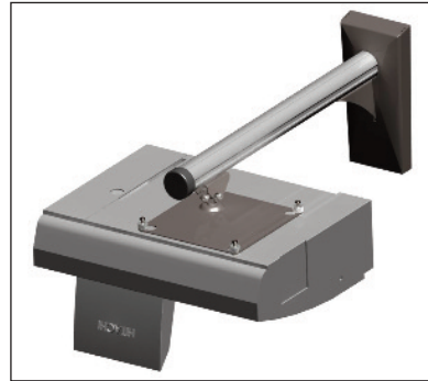
Fully open position projecting 90" image

Innovative, elegant and lightweight it provides an all-in-one, professional solution: quick to install, with total adjustment and integral cable management.