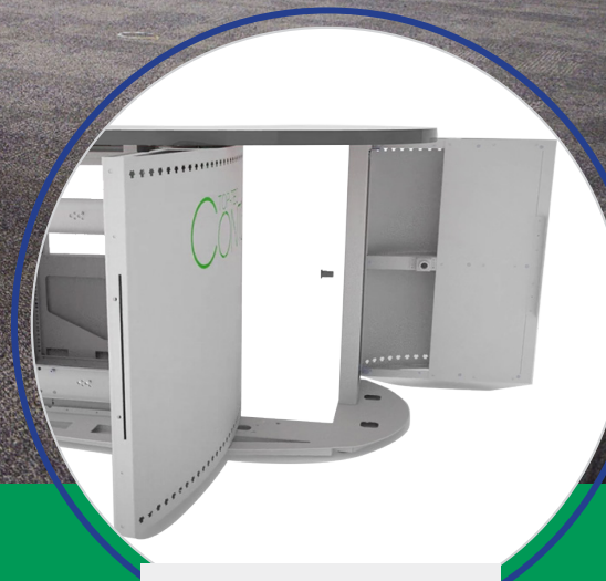
Rotating rear panel (Pico & Nano only)