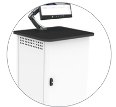
Solid Door (00)