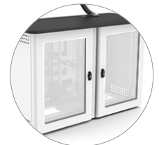
Full Glazed (FG)