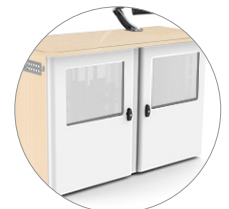
Half Glazed (HG)