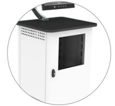
Half Open (8U)