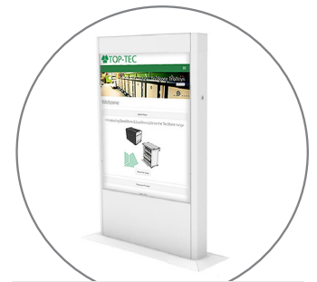
Portrait models available