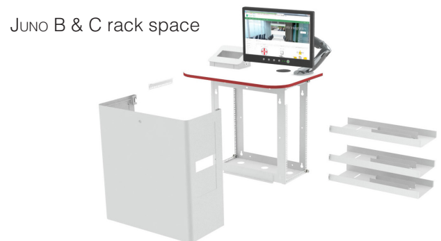
JUNO B & C rack space