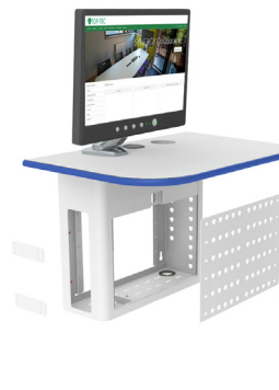
JUNO A storage space

w/ removable panel enabling easy access for maintenance