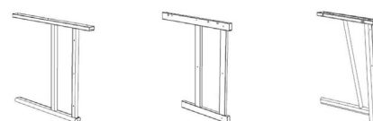
K07 - York