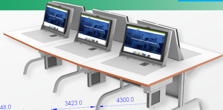
Easy Access IT Spaces Forum Desk